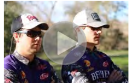
Bethel University Anglers Talk Collegiate Fishing