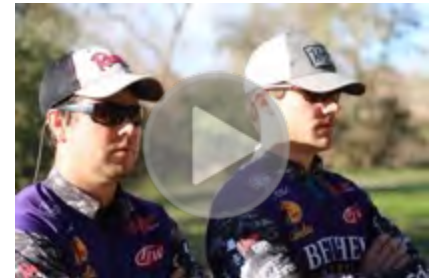
Bethel University Anglers Talk Collegiate Fishing