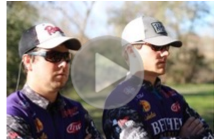
Bethel University Anglers Talk Collegiate Fishing