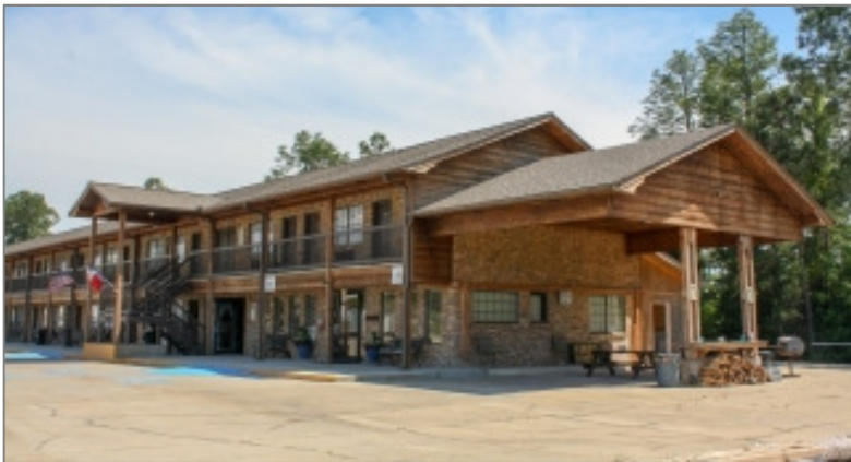
Rayburn Inn 3967 Sam Rayburn Parkway Brookeland, TX 75931 409-698-3002