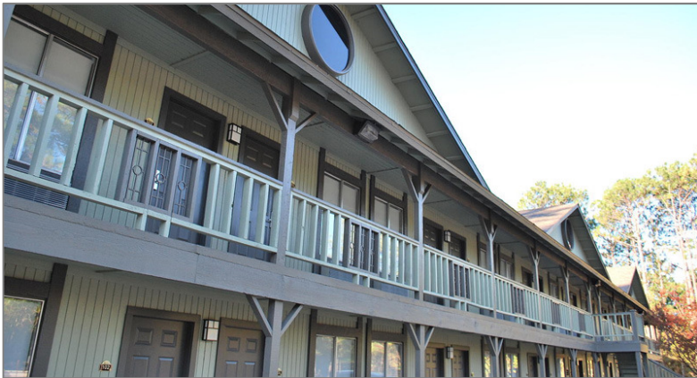
Rayburn Country 2376 Wingate Blvd Brookeland, TX 75931 409-698-2444