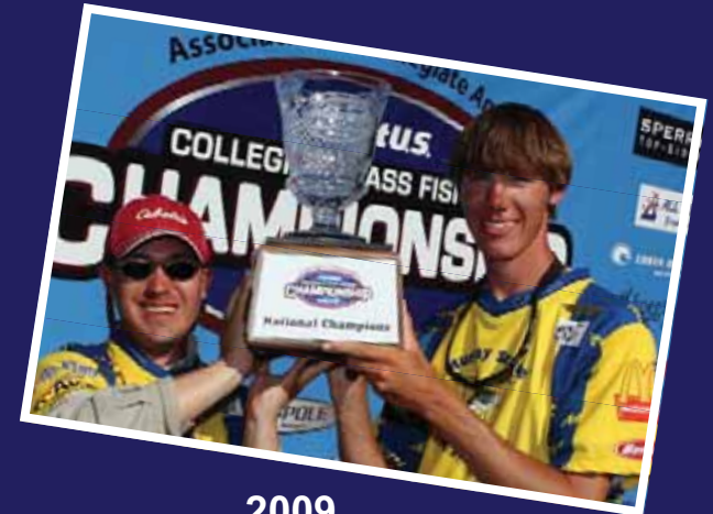
2009 Murray State University