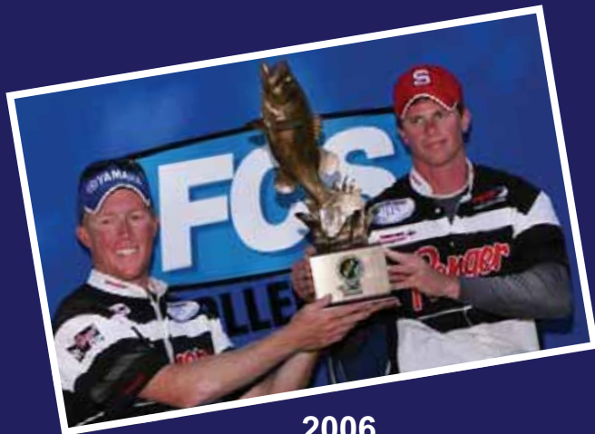
2006 University of North Carolina