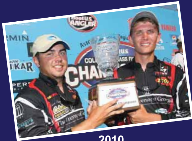
2010 University of Georgia

Past and current national champions represent colleges from across the nation and proudly take their trophy, scholarships, and bragging rights back to their schools!