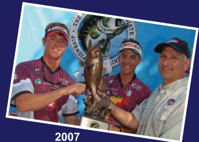
2007 Texas A&M University