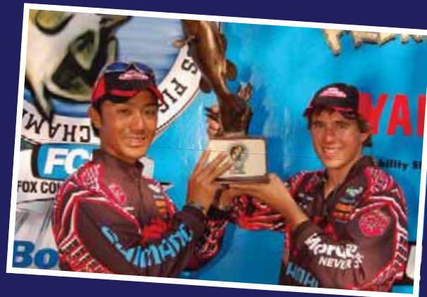
2008 University of Arkansas